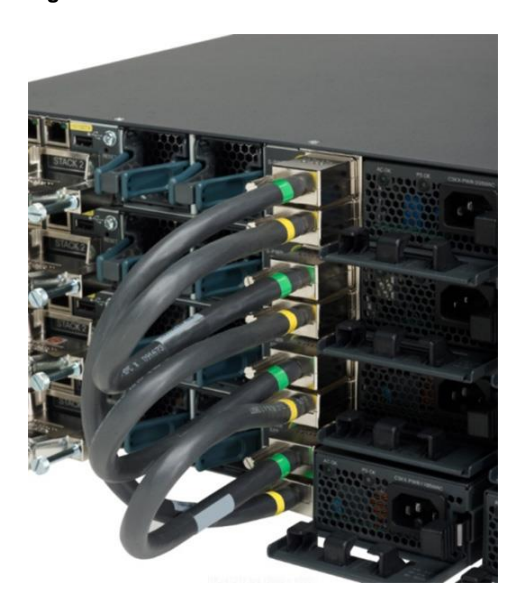
Figure 3. StackPower Connector

StackPower can be deployed in either power sharing mode or redundancy mode. In power sharing mode, the power of all the power supplies in the stack is aggregated and distributed among the switches in the stack. In redundant mode, when the total power budget of the stack is calculated, the wattage of the largest power supply is not included. That power is held in reserve and used to maintain power to switches and attached devices when one power supply fails, enabling the network to operate without interruption. Following the failure of one power supply, the StackPower mode becomes power sharing.