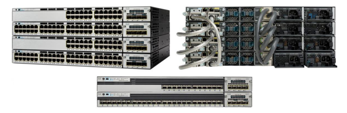
Figure 1. Cisco Catalyst 3750-X Series Switches (Front and Back)

Table 1 shows the Cisco Catalyst 3750-X Series configurations.