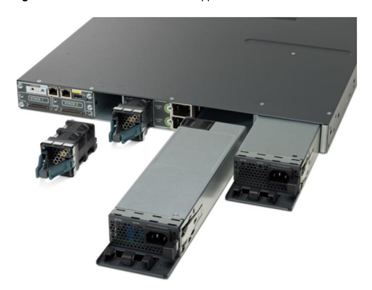
Figure 5. Dual Redundant Power Supplies

Table 6 shows the different power supplies available in these switches and available PoE power.