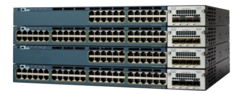
Figure 2. Cisco Catalyst 3560-X Series Switches

Table 2 shows the Cisco Catalyst 3560-X Series configurations.